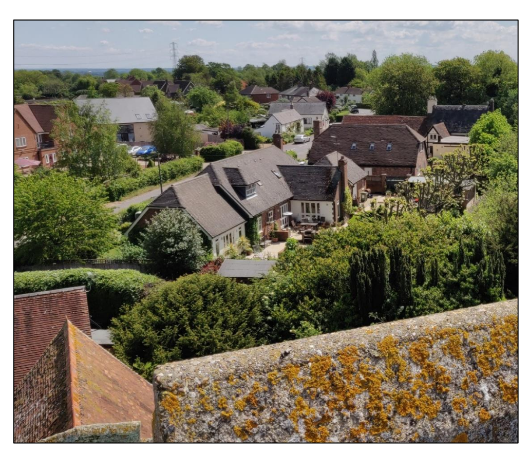
JUNE 2020 Pre-submission (Regulation 14) Version