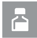
Pharma & Cosmetic