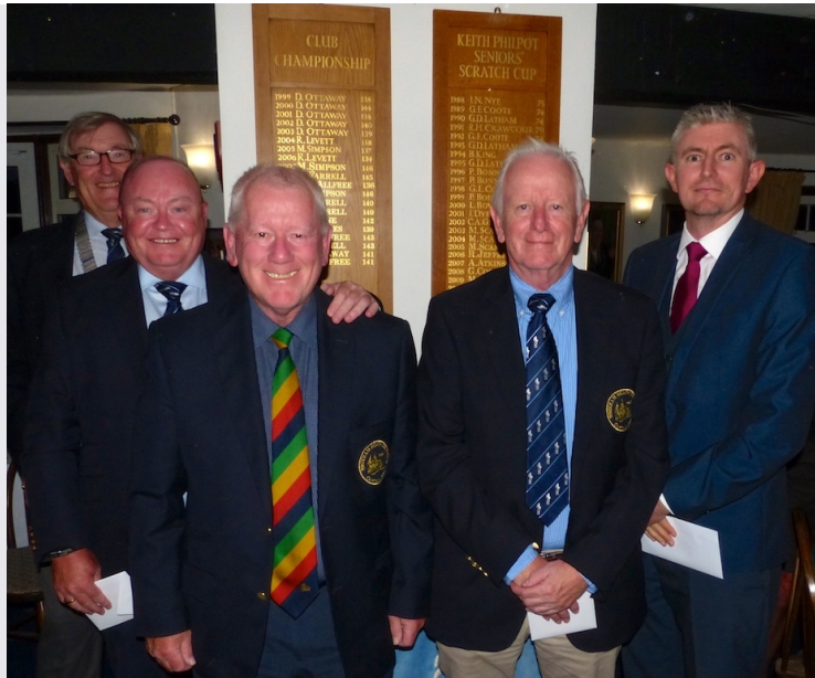
Wrotham Heath 'C' Team wins at home!

Our thanks must go to Wrotham Heath for presenting a golf course in such excellent condition and for the hospitality extended to us all on the very popular and most enjoyable day.