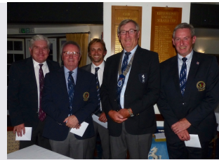
The Sittingbourne & Milton Team take 3rd place