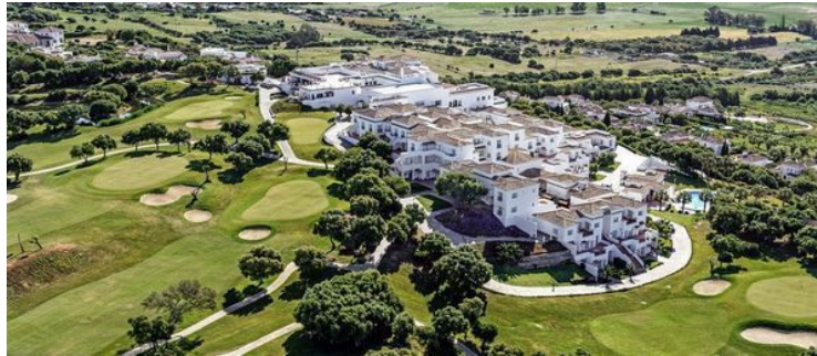
Our Venue for the 2020 Spring Tour

in April last year was held at Belek (Turkey) and was supported by a group of 60 travellers. We stayed at the Kempinski Dome Hotel and played two rounds on the Pasha and two rounds on the