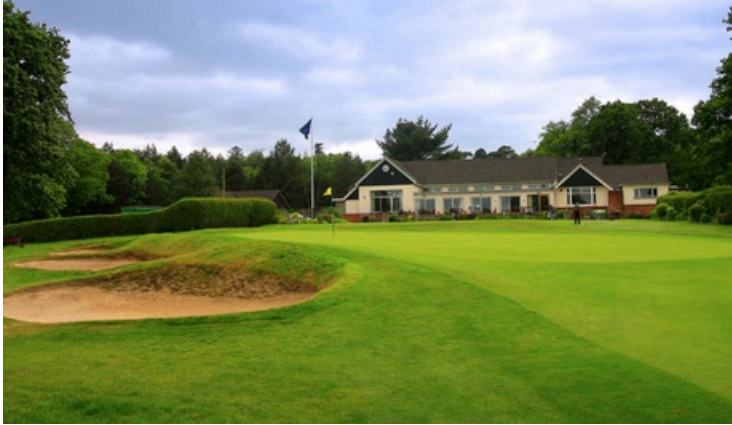
Jubilee Trophy Venue 2019 Stoneham G.C.