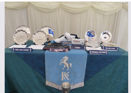
Our Prize Table