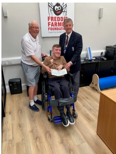
The Captain presents a cheque to the Freddie Farmer Foundation.

For more information on this school and it's work please visit https://www.riversideschool.org.uk/