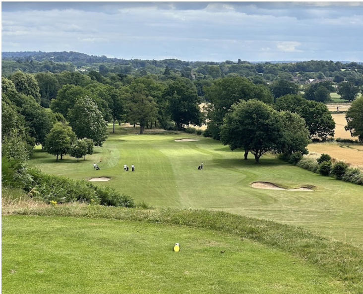
Betchworth Park Golf Club