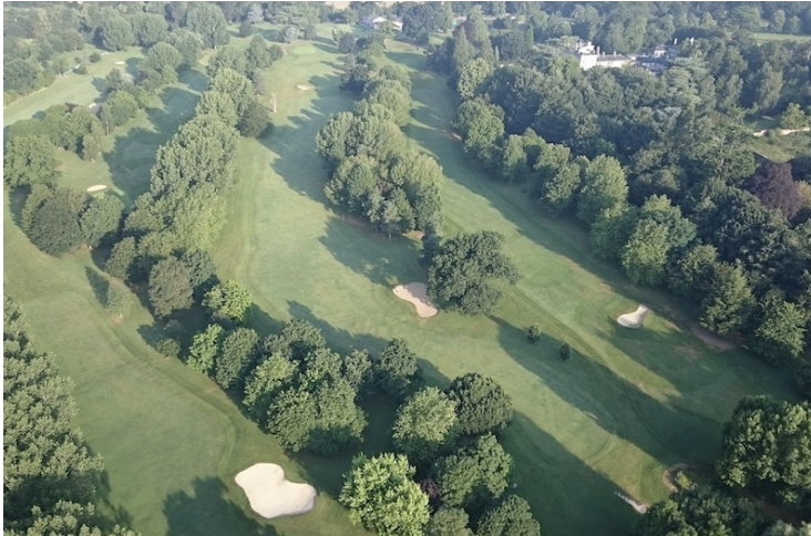
Braintree Golf Course