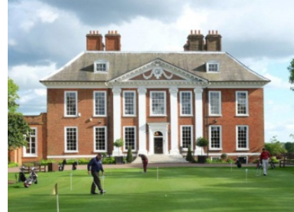
Royal Blackheath GC

It was Kents turn to host The Queens Diamond Jubilee Trophy contest on 27th June this year. The three teams from Sussex, London, and Kent, consisting of committee members gathered on a fine day at Royal Blackheath Golf Club.