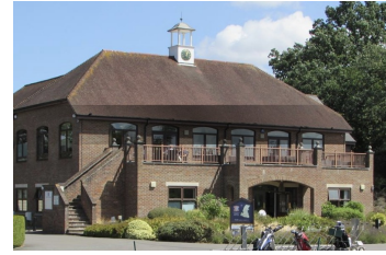
Bearsted G C.

Weds 17th July 2024 played at Bearsted GC, Kent won by 6 games to 4.