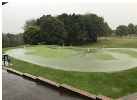
Flackwell Heath GC after the torrent

Our sincere thanks to everyone at West Kent Golf Club. The greenkeepers for presenting a golf course in superb condition. The administrative staff for setting up the day and ensuring its smooth running. To the bar and catering staff in making sure that we were so very well fed and watered!