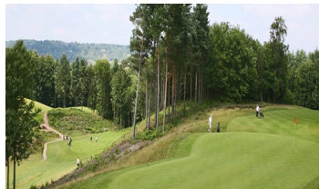
Wrotham Heath G.C.