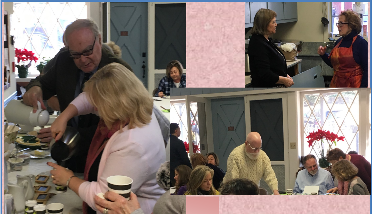
Annual Meeting 2019