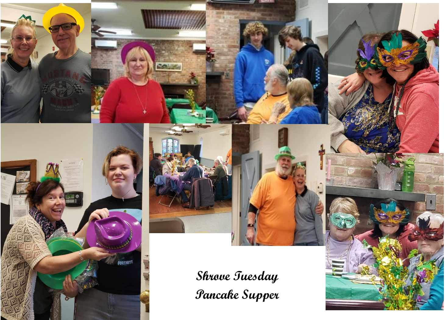
Shrove Tuesday Pancake Supper

All Saints Memorial Church P: 732-291-0214 F: 732-291-1605 www.allsaintsnavesink.org