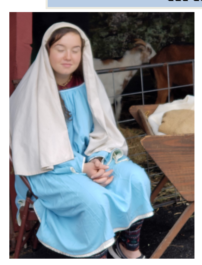
Thank You All