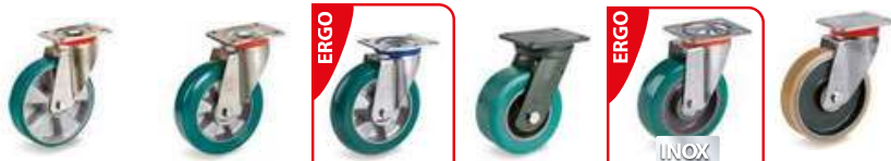
SERIES 62BS PAGE 138