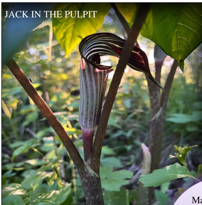
JACK IN THE PULPIT