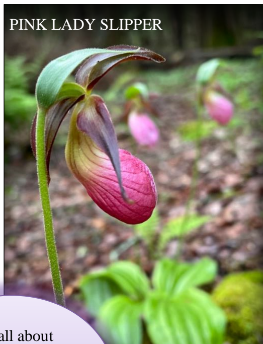
PINK LADY SLIPPER

May is all about flowers. Here are some of the many lovelies that bloom at Shawangunk.