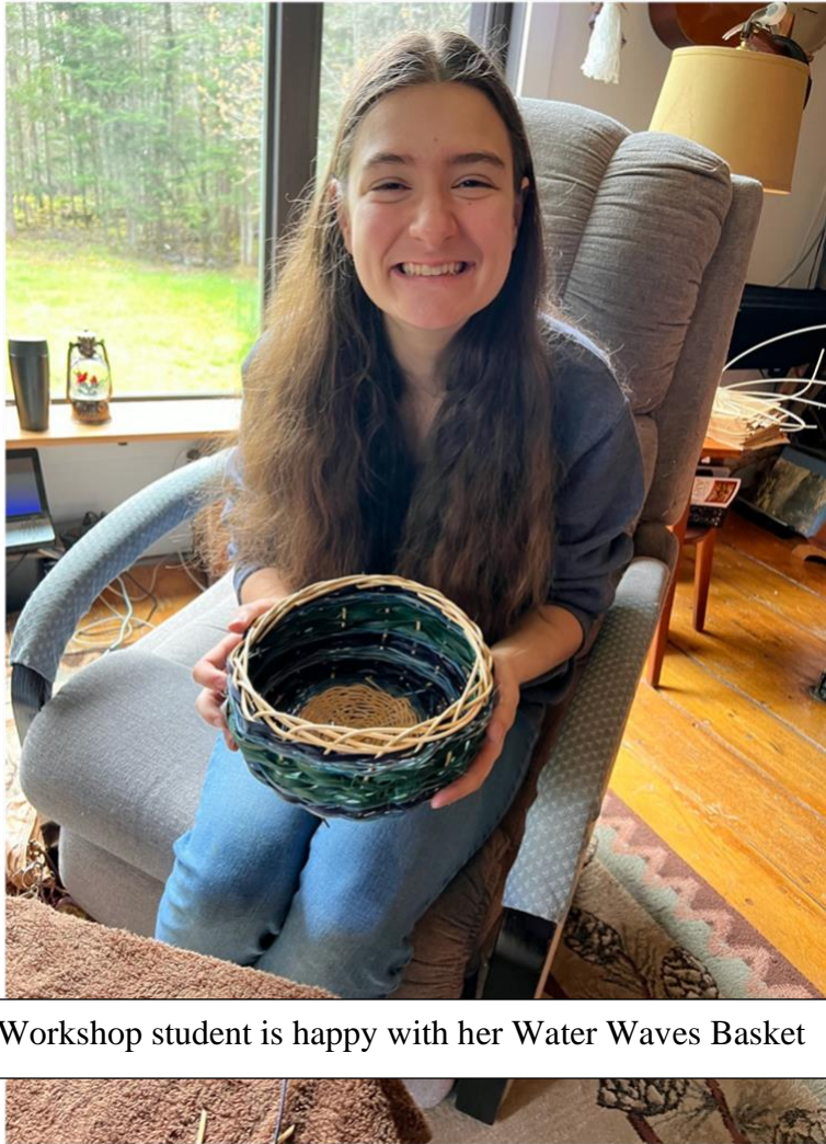
Workshop student is happy with her Water Waves Basket