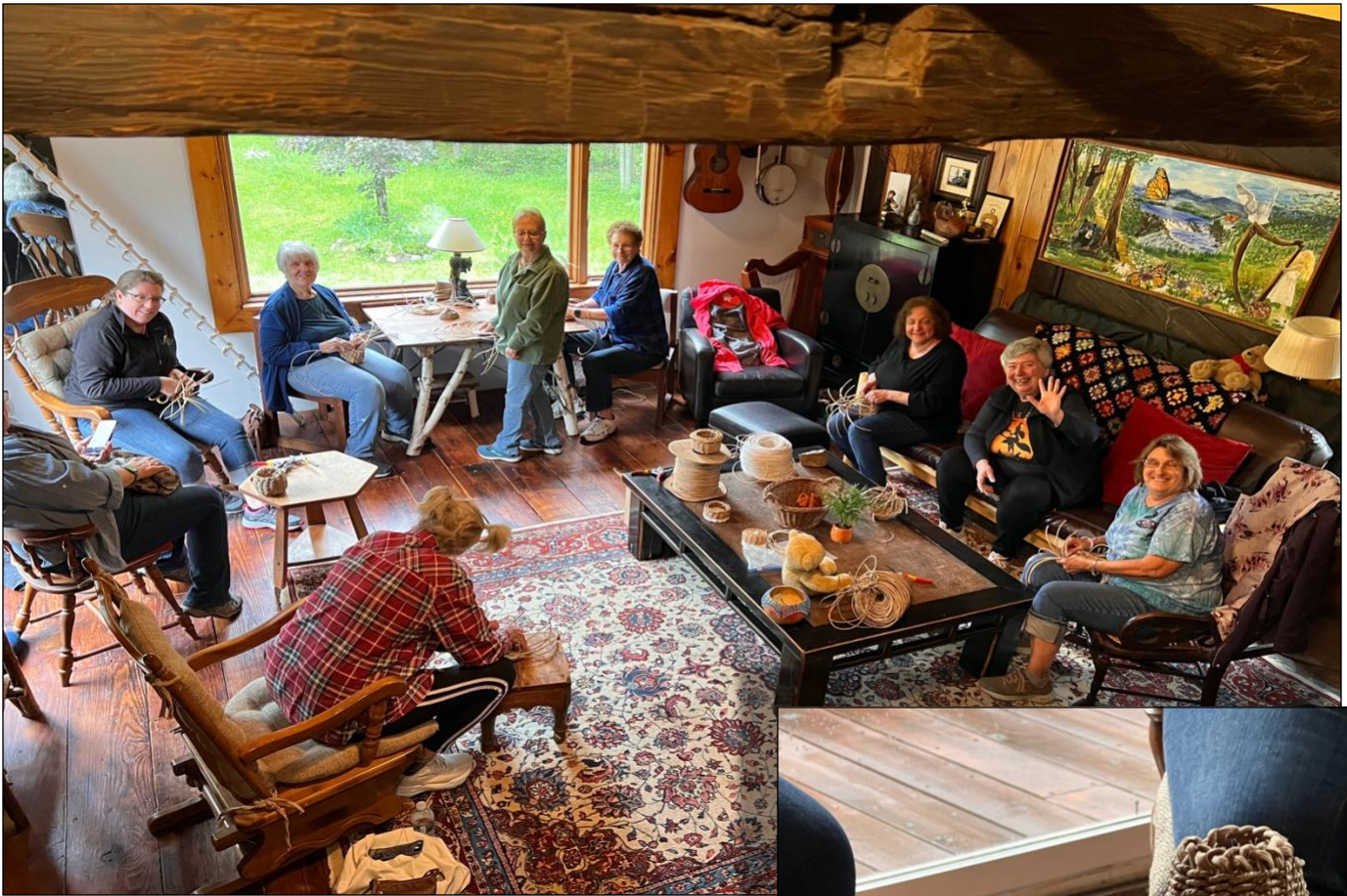
Paper Rush Basket Class was well attended. Everyone had a great time and went home with new skills and a unique basket.