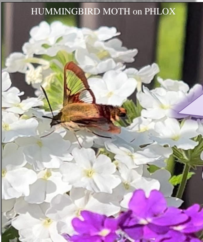
HUMMINGBIRD MOTH on PHLOX

This curious and beautiful winged creature is called a Hummingbird Moth, an example of Convergent Evolution which refers to two organisms which “look or behave in a similar way, even though they’re only distantly related.” This moth hovers in a similar way to a hummingbird. It has no known bite or sting and is the adult stage of the tomato hornworm caterpillars which can sometimes devastate tomato and other garden plants.