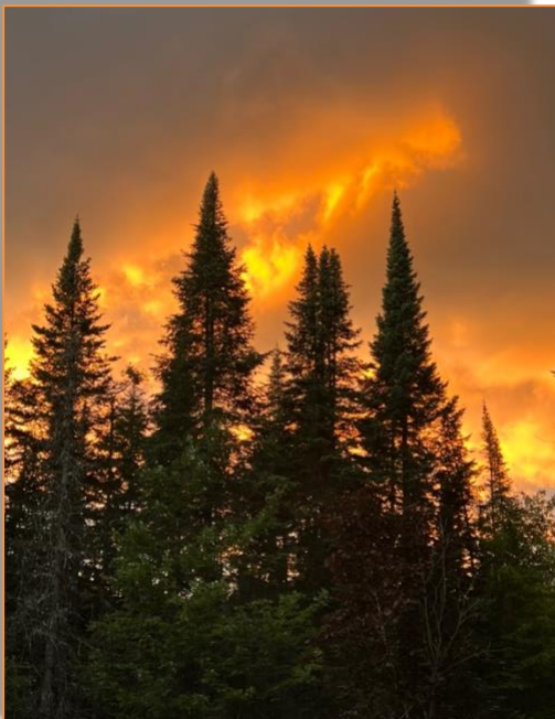
Dramatic sunset light recently in SNP