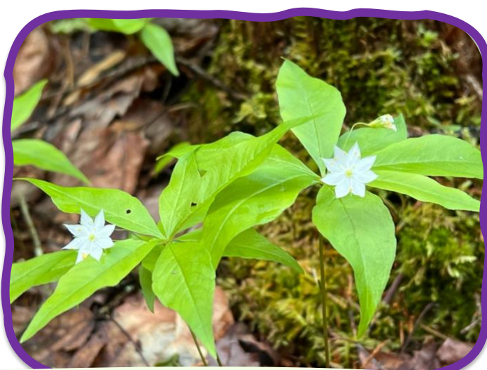
Canadian Anemone (left) and Starflower (right) are among the many wildflowers that thrive at SNP.