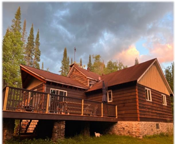
Whispering Pine Lodge