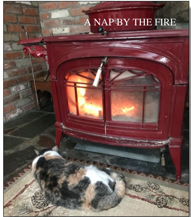
A NAP BY THE FIRE