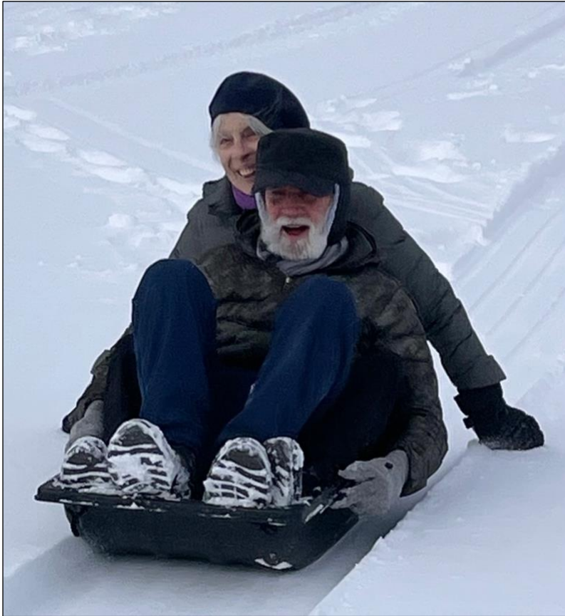
FAMILY SLEDDING THE SLOPE AT TRENTON TOWN PARK, Barneveld NY