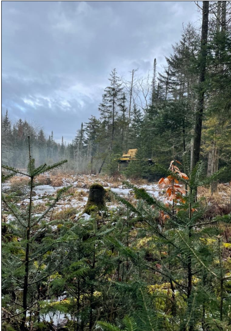
Our Beaver Pond Overlook