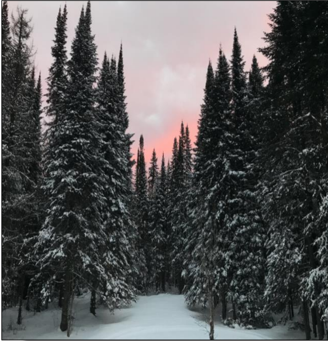
Sunset in the SNP forest.

A study out of Germany recently published in the journal Scientific Reports showed that the more trees a neighborhood had, the fewer prescriptions for antidepressants among its residents. The effect was particularly strong among the less wealthy.