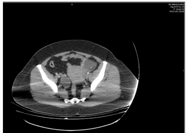
Figure 1. A cyst located in the left ovary and uterin myoma was revealed at CT image of the patient

During laparoscopic myomectomy, transvaginal ultrasound guidance should be kept in mind in terms of the localization of myoma, the possibility of residual myoma, and evaluation of endometrial integrity.