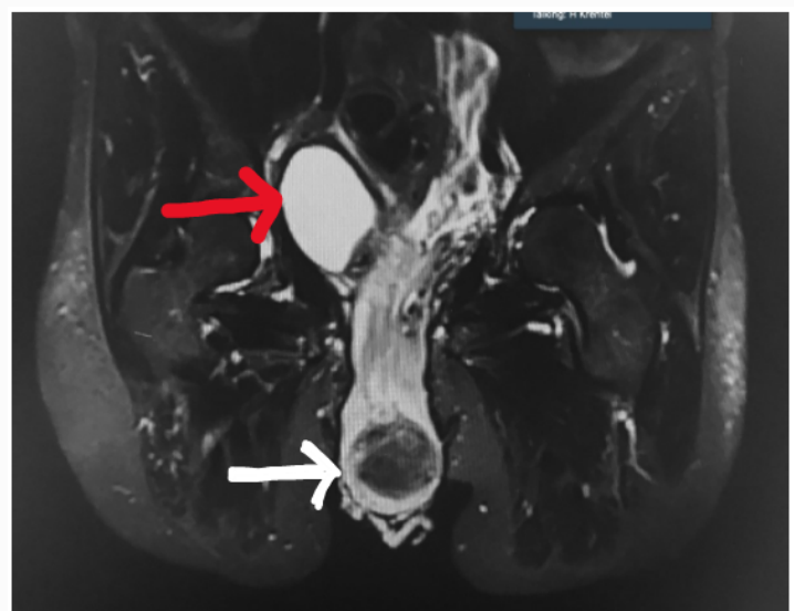
FIGURE 1: AXIAL T2-WEIGHTED IMAGE PREOPERATIVE MRI ACQUIRED BEFORE THE SURGERY, SHOWS UTERINE INVERSION UTERUS (WHITE ARROW), BLADDER (RED ARROW)

Treatment of uterine inversion depends on patient's fertility, possible etiology and stage of inversion (5). Leiomyoma was the most common cause for non puerperal causes (56.2% of the cases) (6). Kustner and Spinelli procedures are done by vaginal route to reinvert uterus to its anatomic position by a vertical incision on the cervicoisthmic constriction ring. On the other hand, surgery can be done by abdominal approach with Huntington and Haultain procedures to reduce the uterine incision to a minimum (7). In patients with benign disease, where these procedures are not successful, abdominal or vaginal hysterectomy is recommended.