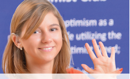
Topic "Discovering the Optimism within Me"