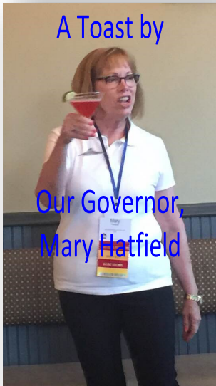
A Toast by