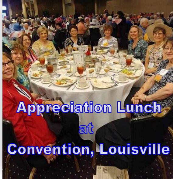
Appreciation Lunch at Convention, Louisville