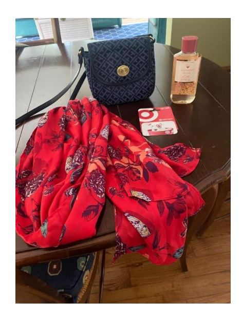
Ellie King's haul was a red scarf, shower gel, and a $50 Target gift card.