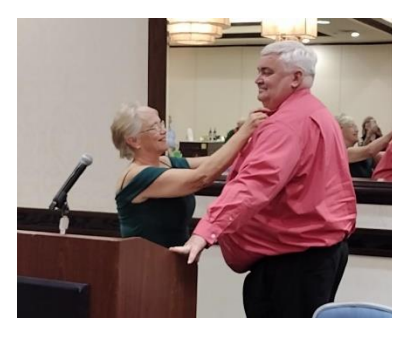
Governor Lauren Dell pins Governor Designate Ernie Wren