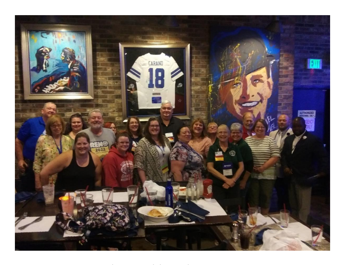
EMO Members attend district dinner at OI Convention