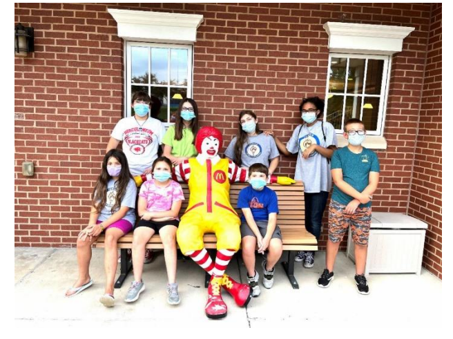
JOI Club members pictured with Ronald McDonald figure.