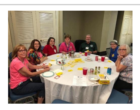
TCA members enjoy games with fellow EMO members.