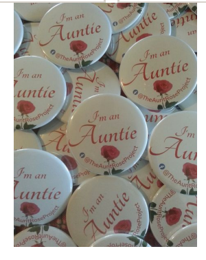
"I'm an Auntie" pins were distributed to donors