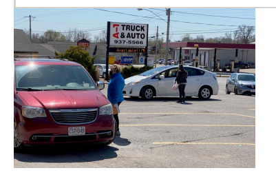
Members line up to drop off donations.