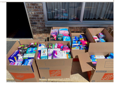
Boxes filled with donations...and more already loaded for delivery.