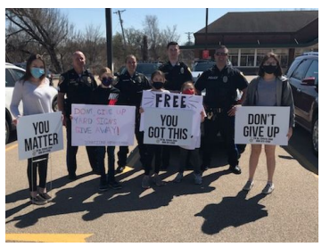
JOI members with Festus Police Officers