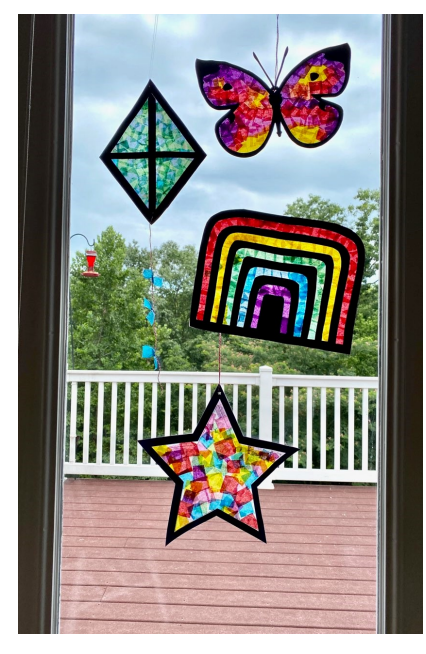
Optimist Patty Meyer's Art Challenge