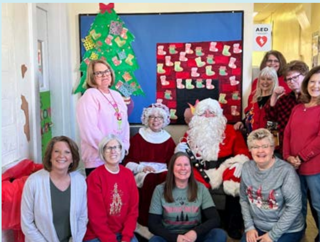
Hematite Headstart party participants