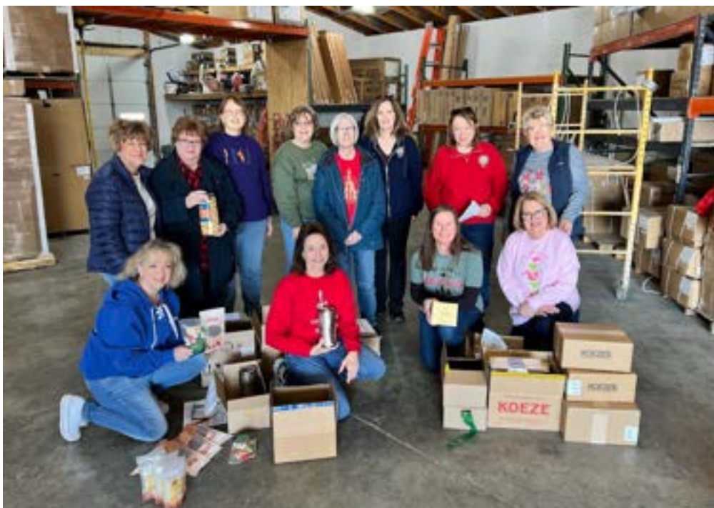
The Koeze Nut sorting volunteers