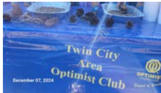
Pat Parson helped to with the bird seed creations