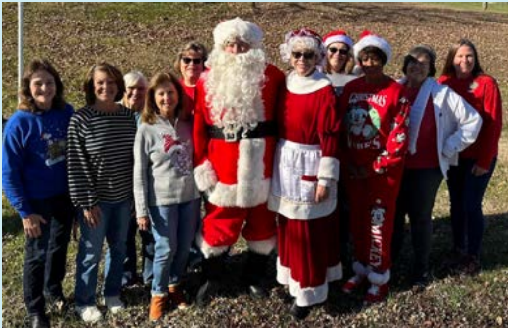
De Soto Headstart party participants