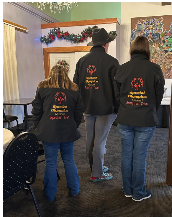
Olympians displayed the backs of their jackets.