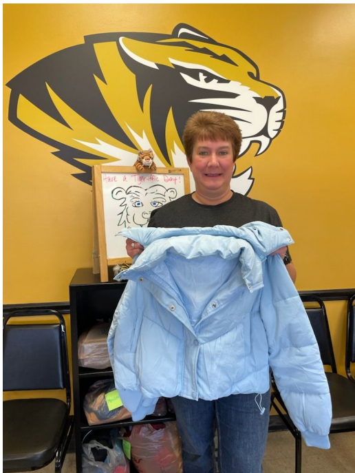
Coat deliveries to De Soto and Festus school counselors.