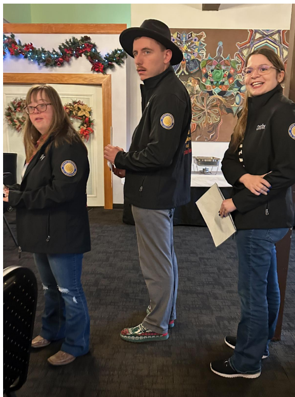
Olympians displayed the Optimist logo on their jackets.