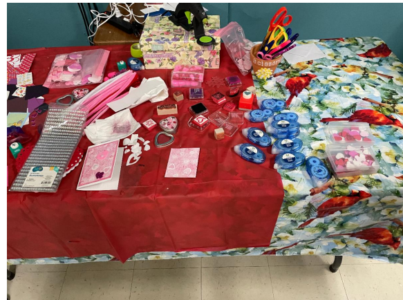
Some of the art supplies that Beth Winkler brought for making cards.