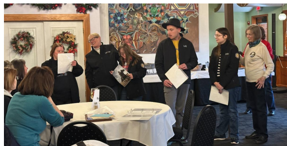
The Olympians shared why they enjoy riding.