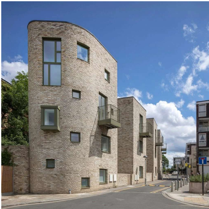
RIBA names best British buildings for 2022