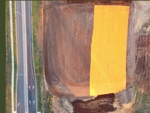
RSL REMEDIATION - DUBBO Lyons Project Management $8 million

Completed upgrades to the council road to provide access to the site's internal roads and laydown areas. For the solar farm's internal power, WCG provided trenching throughout the area.