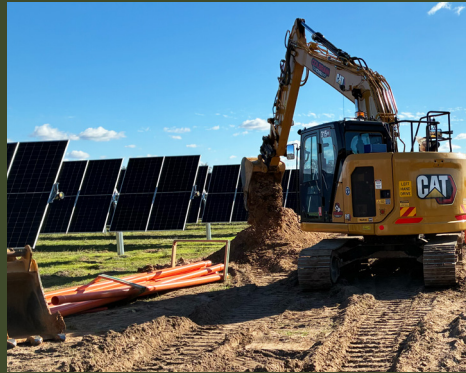
SOLAR FARM - GILGANDRA YES Group $6 million

Total land development and civil operations for a 215 Lot Subdivision to create 'Holmwood' Estate. Designed ensuring spacious lots, quality infrastructure, and seamless integration with Dubbo's growing landscape.