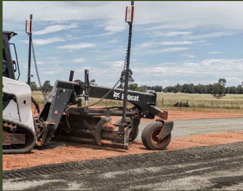
'HOLMWOOD ESTATE'- DUBBO Western Plains Civil Construction $34 million

Total land development and civil operations for a 215 Lot Subdivision to create 'Holmwood' Estate. Designed ensuring spacious lots, quality infrastructure, and seamless integration with Dubbo's growing landscape.