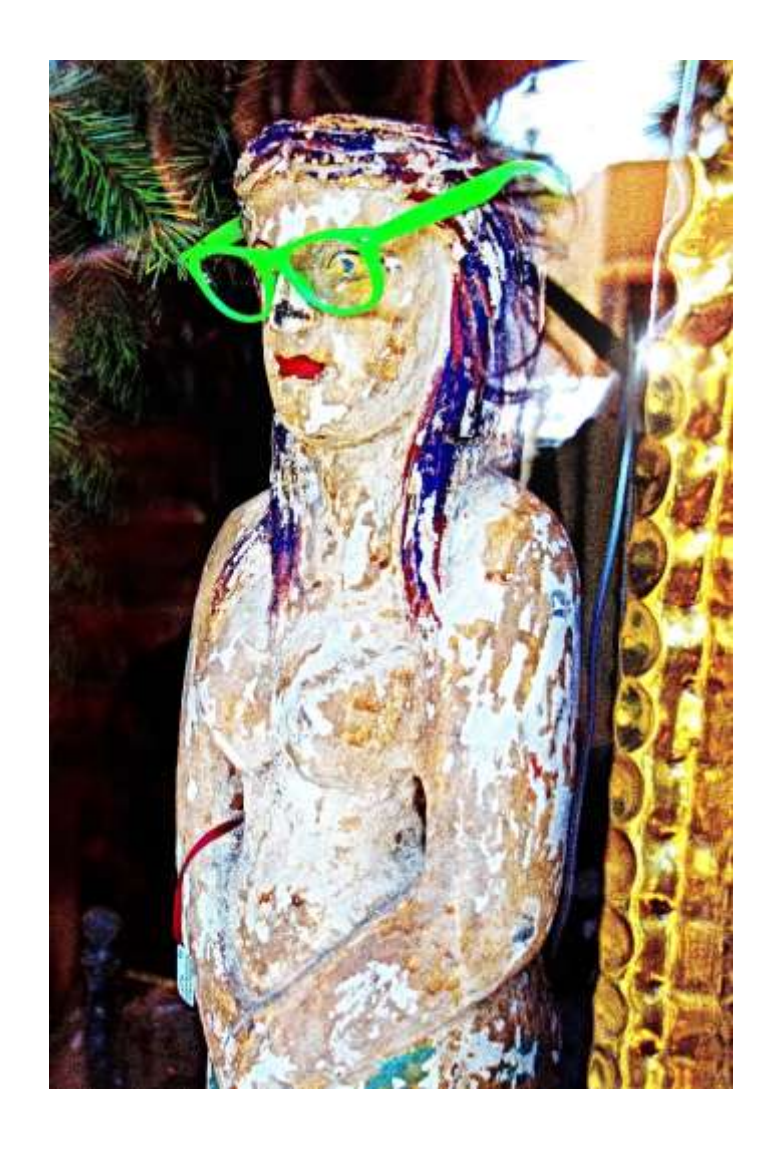
Wooden Muse / kerry rawlinson