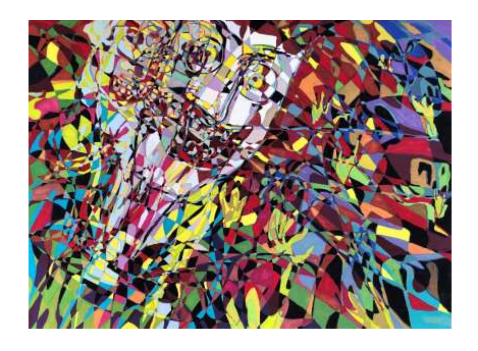
Villainy 09 / Nicole Foran