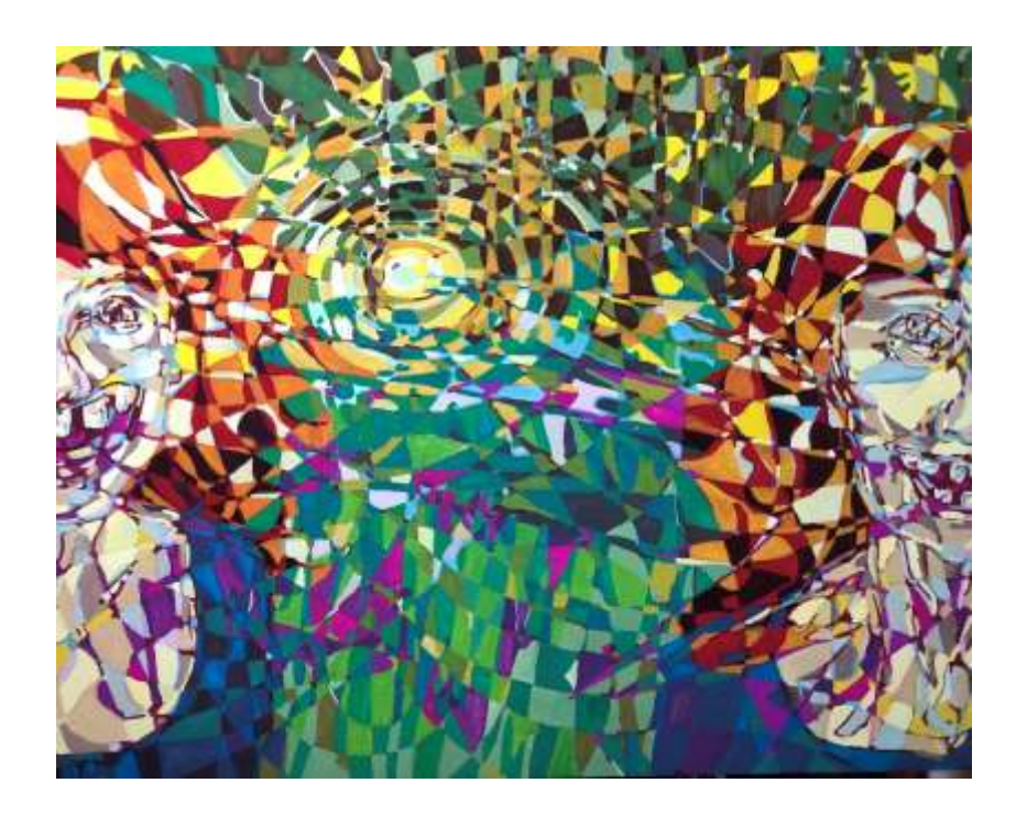
Villainy 04 / Nicole Foran