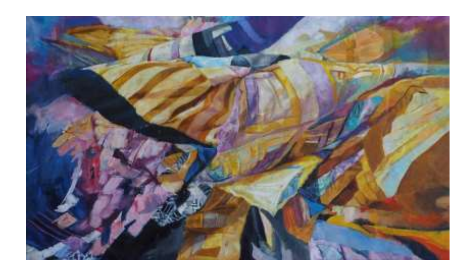
Quilted Landscape / Christina Klein