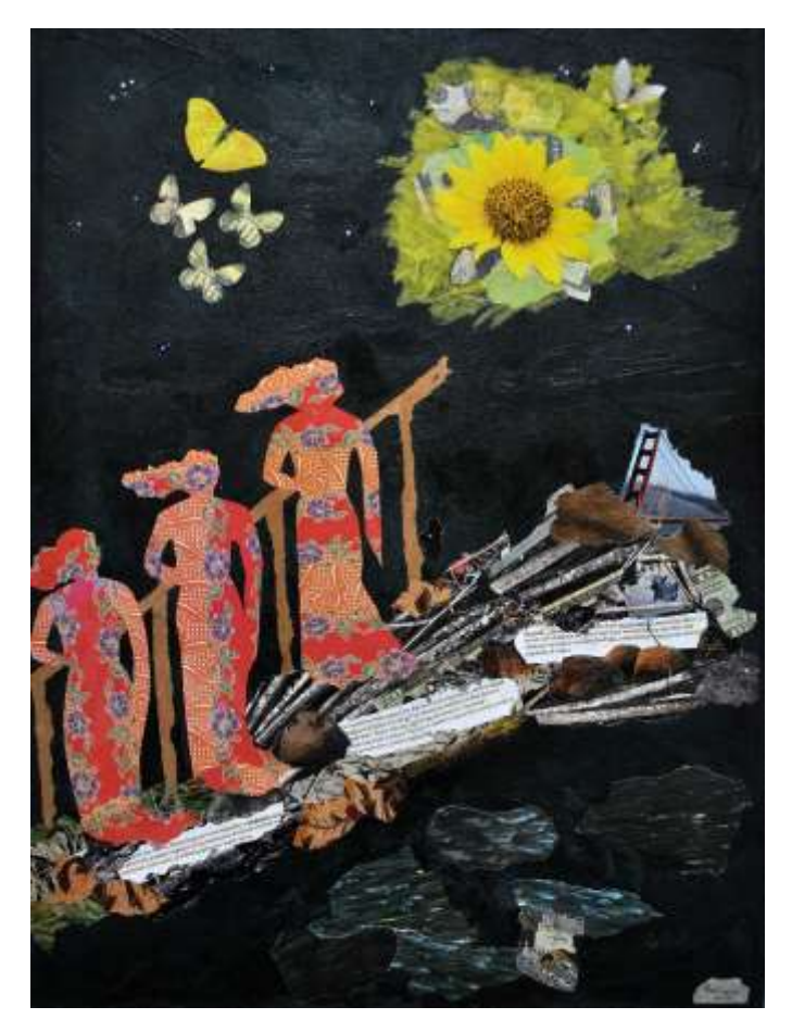
The Bridge / Hediana Utarti

CHANGING THE WORLD THROUGH WORDS AND ART