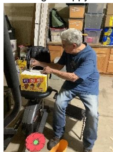
Creating a Poppy Fan