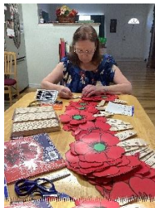
Creating a Poppy Fan