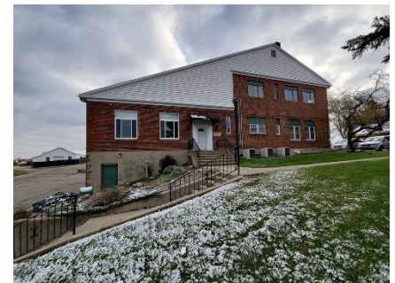
National Home for Children Education & Training Center.

Elections will take place this year for open positions in District 6 (Kentucky, Louisiana, Mississippi, Missouri, Tennessee) and the District 10 (Arkansas, New Mexico, Oklahoma, and Texas) for six-year terms both ending October 2028.