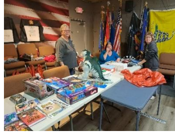
VFW Auxiliary Post 10054 had a working Meeting in December. Wrapping presents and delivering them to Veterans in the Retirement Homes and Rehabilitation Centers in Pahrump, NV.