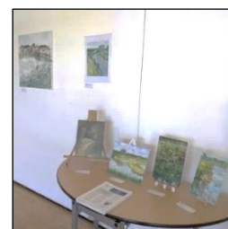
The exhibition at the Wetland Centre

Works created during the competition are now displayed in the gallery at the Wetland Centre until 31st August, with works for sale to benefit worldwide wetlands conservation.