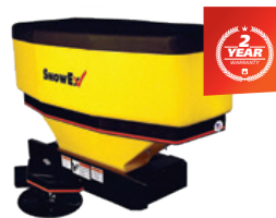
MODEL SHOWN SP-1875-1