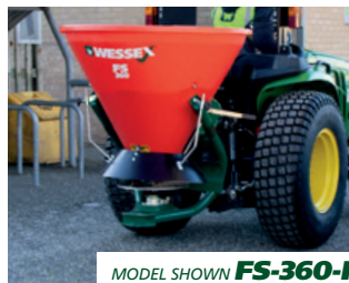
MODEL SHOWN FS-360-P