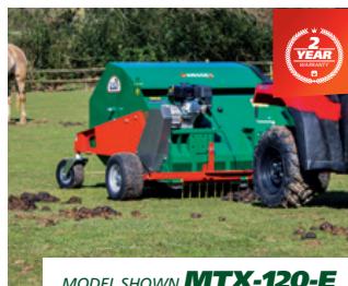
MODEL SHOWN MTX-120-E