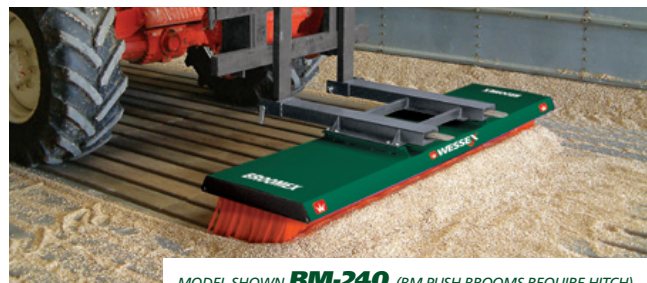
MODEL SHOWN BM-240 (BM PUSH BROOMS REQUIRE HITCH)