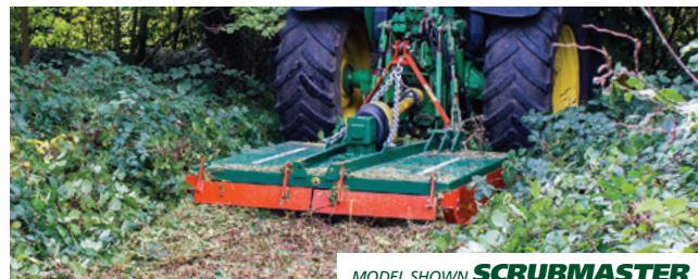
MODEL SHOWN SCRUBMASTER