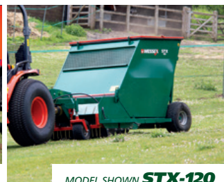
MODEL SHOWN STX-120