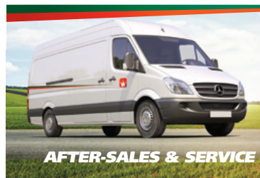
AFTER-SALES & SERVICE