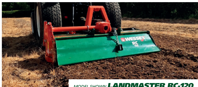
MODEL SHOWN LANDMASTER RC-120