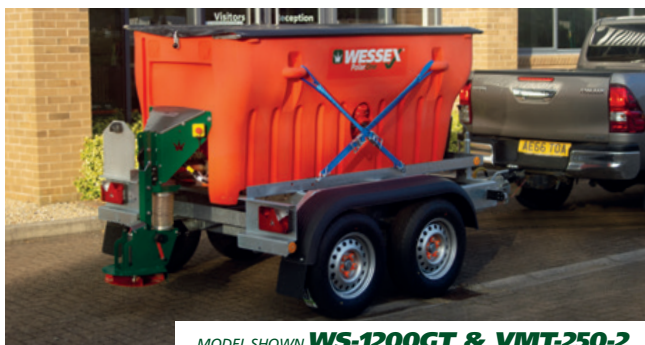
MODEL SHOWN WS-1200GT & VMT-250-2