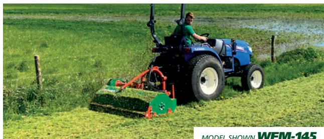
MODEL SHOWN WFM-145