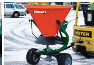
MODEL SHOWN FS-270-TP-WK