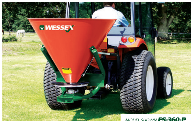
MODEL SHOWN FS-360-P