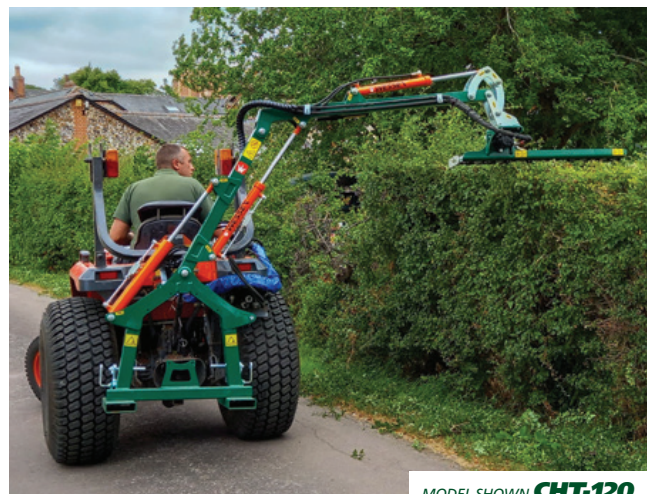
MODEL SHOWN CHT-120