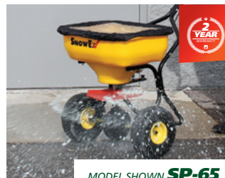
MODEL SHOWN SP-65