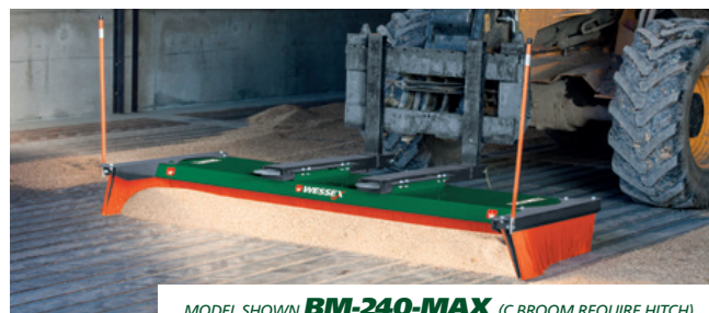
MODEL SHOWN BM-240-MAX (C BROOM REQUIRE HITCH)