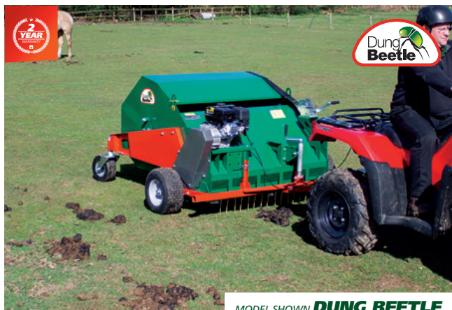
MODEL SHOWN DUNG BEETLE