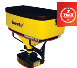
MODEL SHOWN SP-575X-1