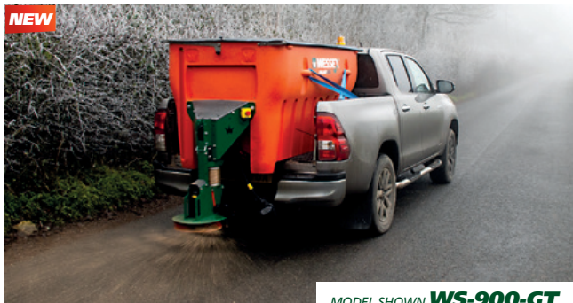
MODEL SHOWN WS-900-GT