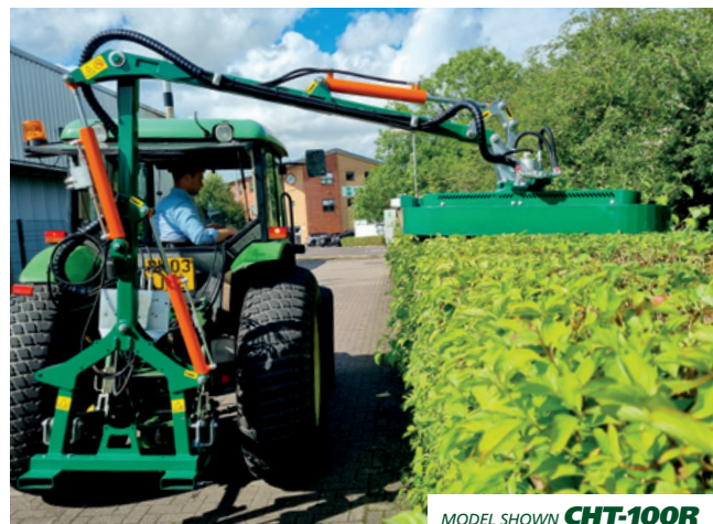
MODEL SHOWN CHT-100R