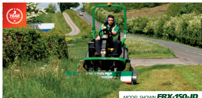
MODEL SHOWN FRX-150-JD