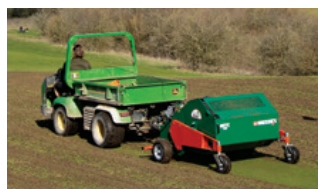
MODEL SHOWN MTC-120-PRO