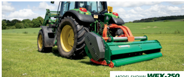
MODEL SHOWN WFX-250