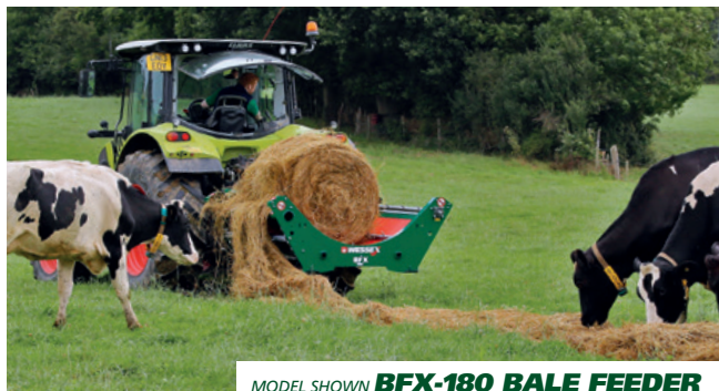
MODEL SHOWN BFX-180 BALE FEEDER