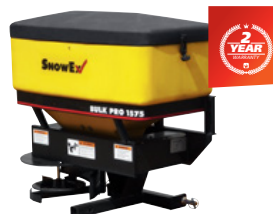
MODEL SHOWN SP-1575-1