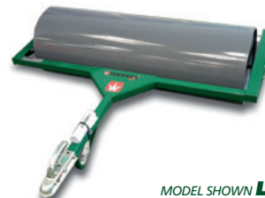
MODEL SHOWN LAND ROLLER