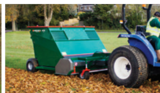
MODEL SHOWN STC-180