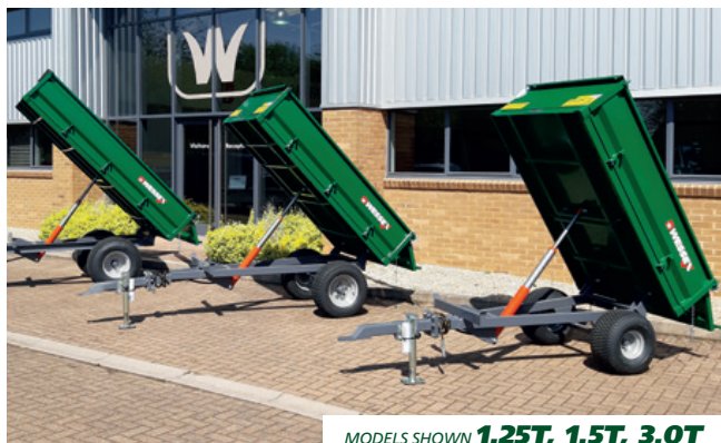
MODELS SHOWN 1.25T, 1.5T, 3.0T