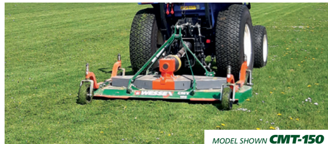
MODEL SHOWN CMT-150