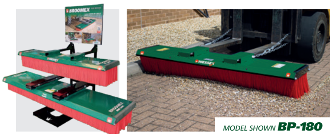
MODEL SHOWN BP-180