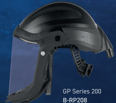
GP Series 200 B-RP208