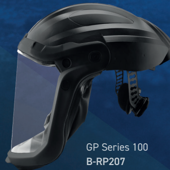
GP Series 100 B-RP207