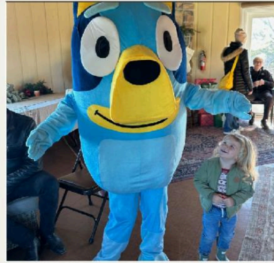
Bluey & Friend