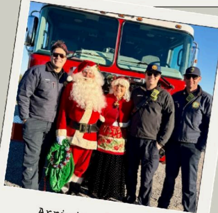
Arriving in style