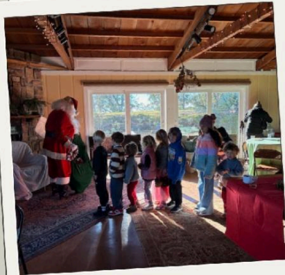
Waiting to meet Santa!