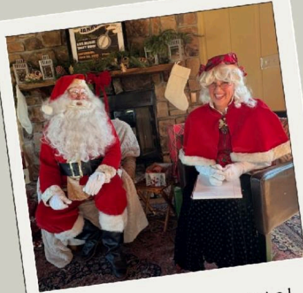
Mr. & Mrs Claus = cute!

P.S. Santa or Mrs. Claus, if you're reading this, we're still waiting for world peace 😊.