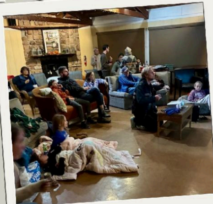
Ready for Home Alone