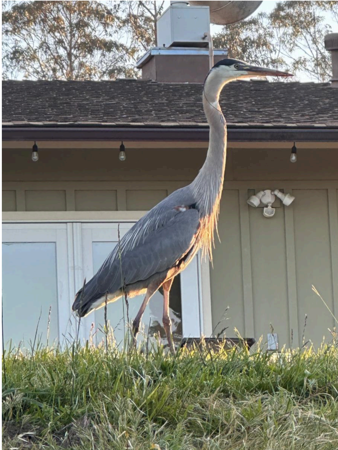
A guest at last Sunday's café