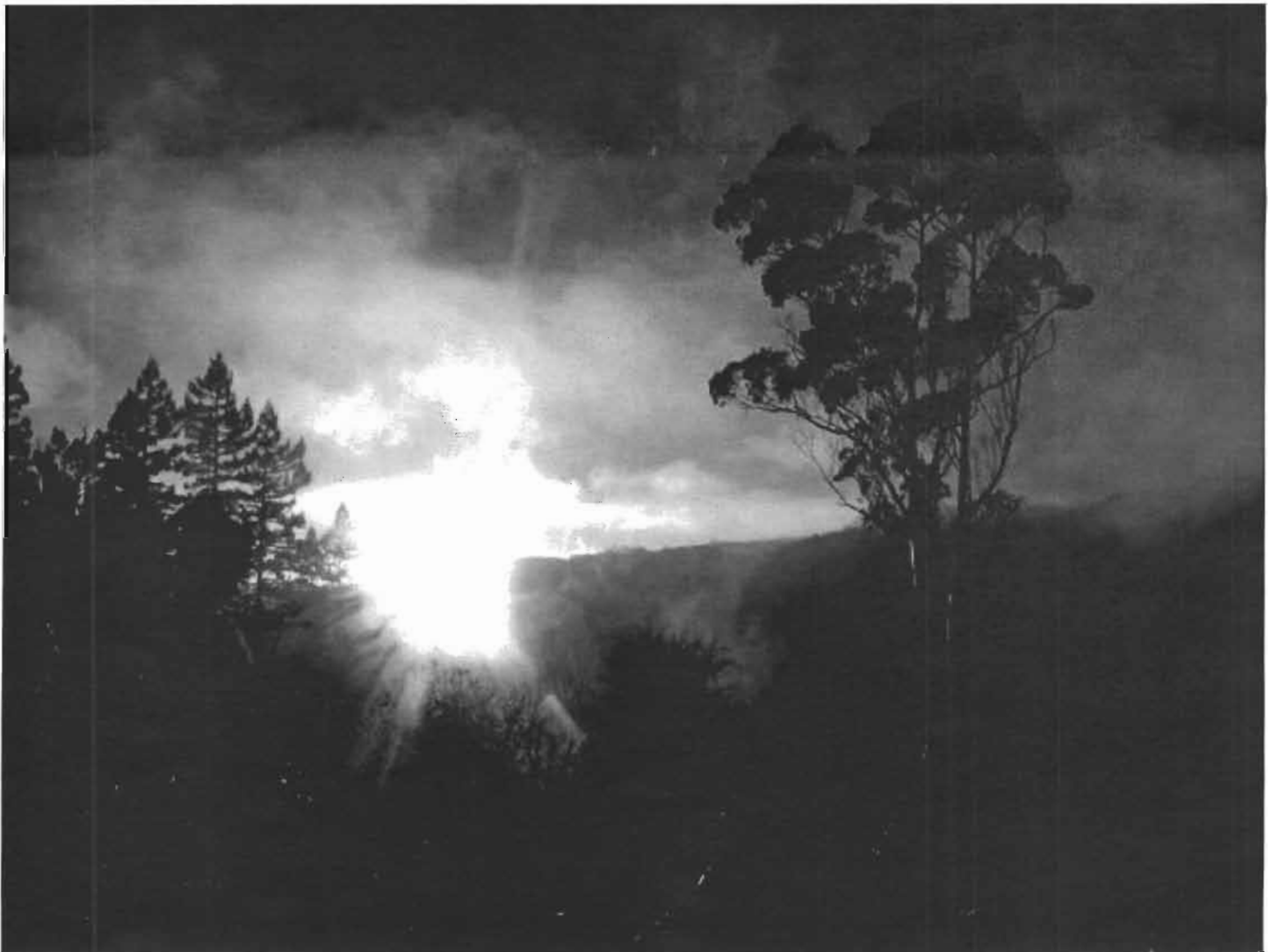
View from Panoramic and Ridge