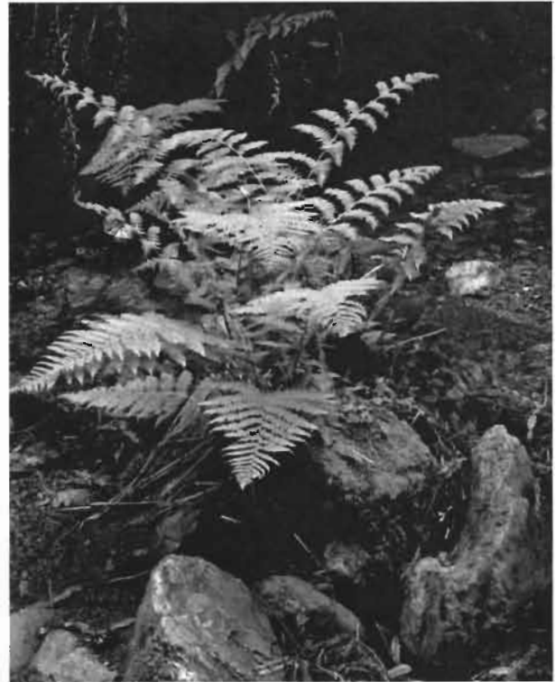
Steep Ravine Fern