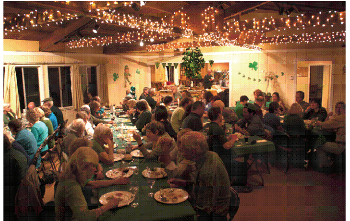
2011 St Patrick's Day Dinner

MWPCA Community Center, 40 Ridge Avenue Adults—$20 / Children under 14—$10