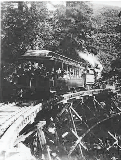
Train to the top of Tamalpais, circa 1910

This is the first in a series of stories about historic homes and structures on Mt Tamalpais. What constitutes the term 'historic' is subjective. For this purpose, we will be featuring 'homes with a story'. Ever since the Mt. Tamalpais and Scenic Railway brought weekend adventurers up the mountain via steam, and down via gravity, people have been discovering the