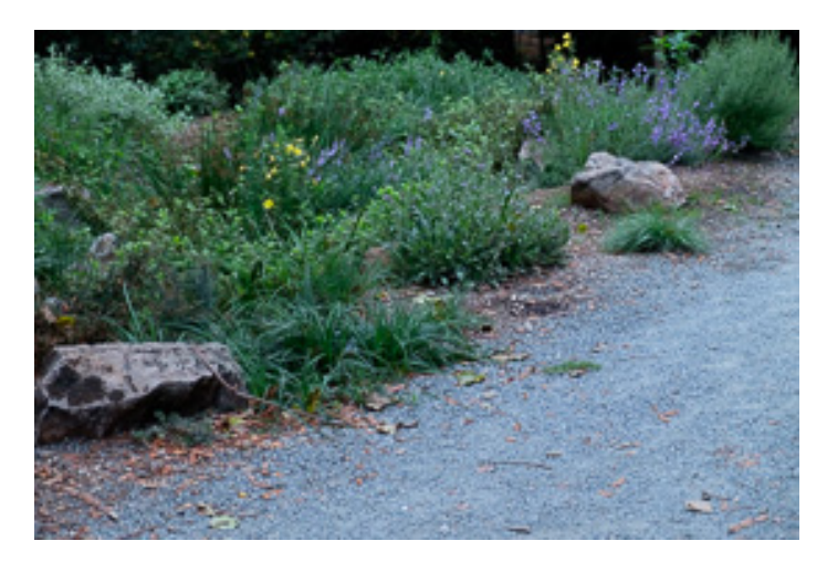
garden, which consists of native plants, edibles, medicinals and other beneficial plants.