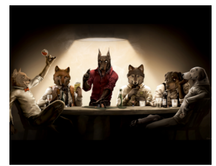
Dogs are indeed welcome at MWPCA Board Meetings, and refreshments are usually enjoyed.

Please join us on November 12<sup>th</sup>, bring something delicious to share; the club will provide drinks for attendees.