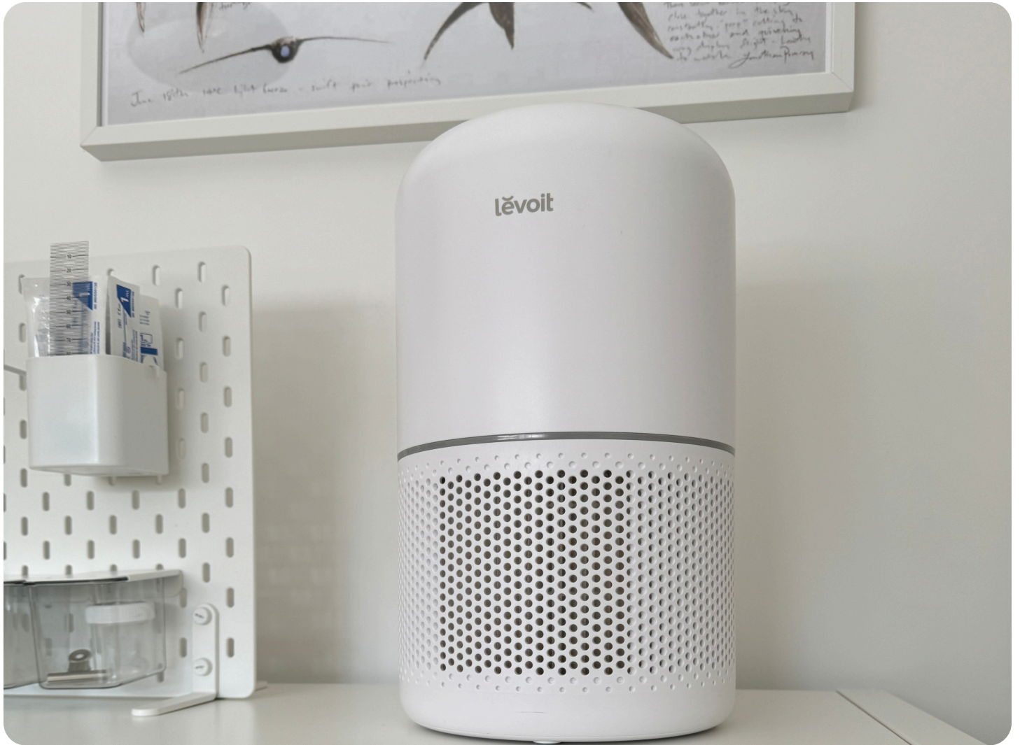
Levoit Air Purifier

Acute cases, naked swift chicks need to be maintained in a more controlled area.