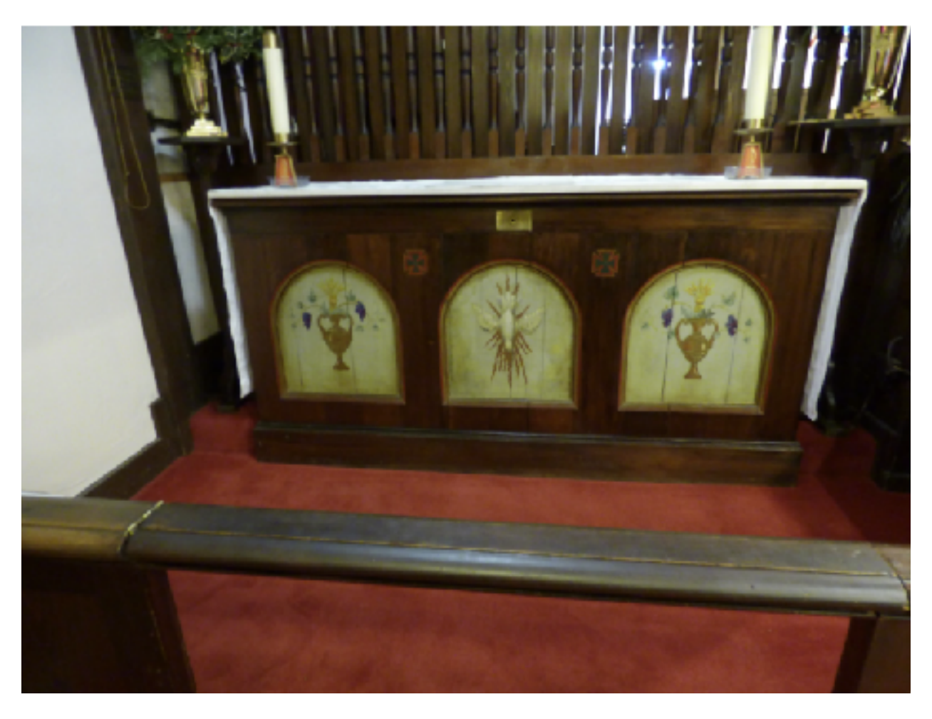
St. Andrew Church Alter, 1931