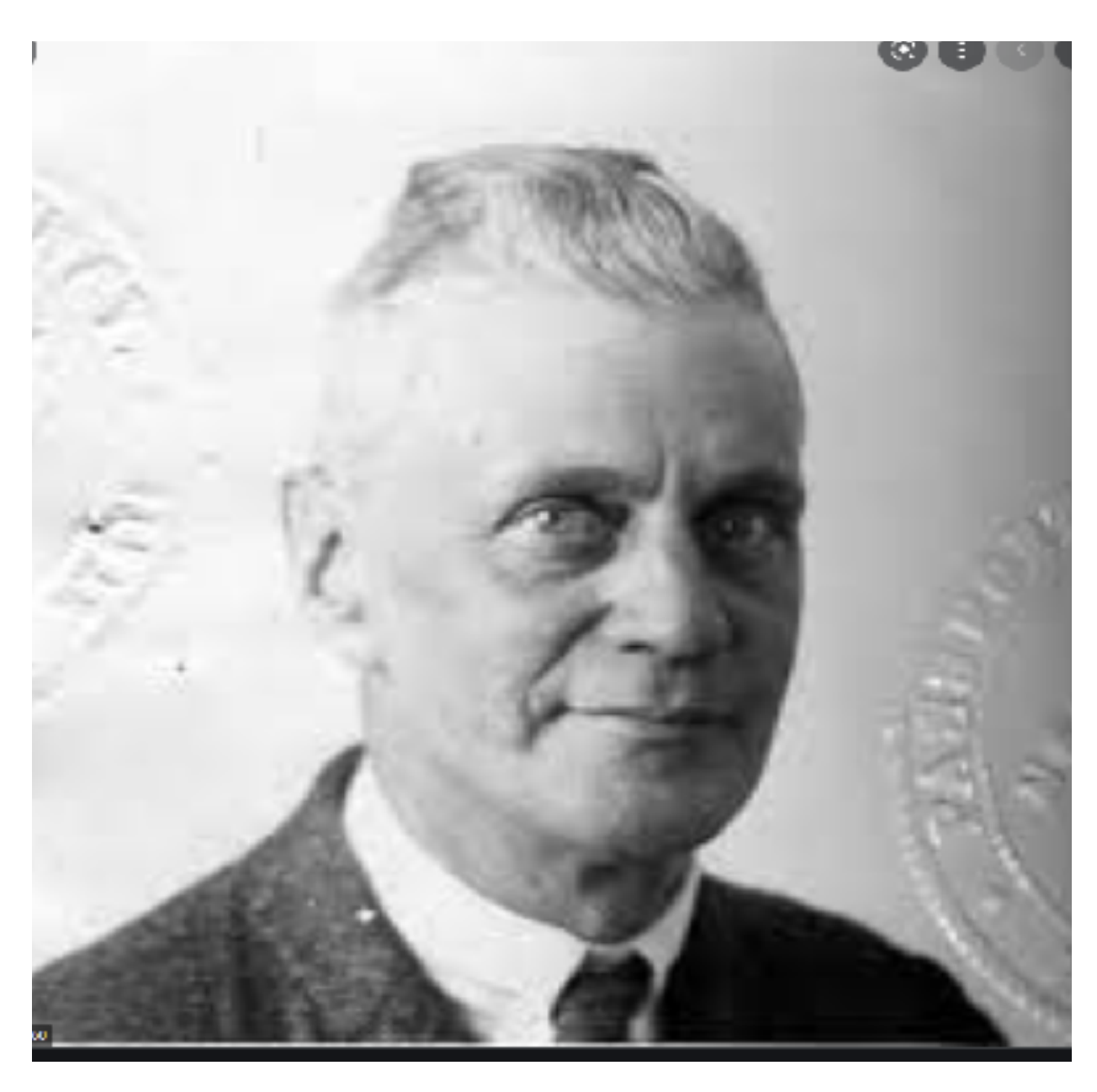
1924 Passport photo