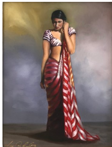
THIRD PLACE Sensual Amparo de la Cruz _ Oil