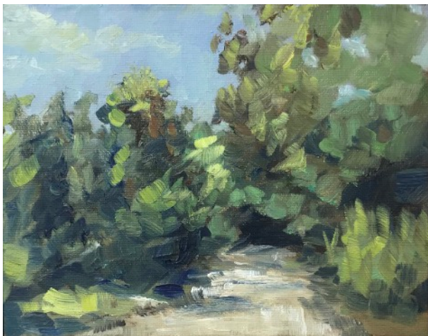
SECOND PLACE Riverbend Trail Cristina Cuevas _ Oil

© All art images are copyrighted by the individual artist.