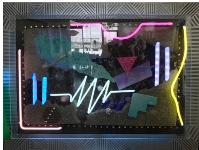
RECOGNITION Illumination Invasion Anatolyj Okatgj_ Found Mixed Media Construction