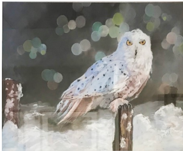
FIRST PLACE Snowy White Owl Darcy Doiel _ Pastel