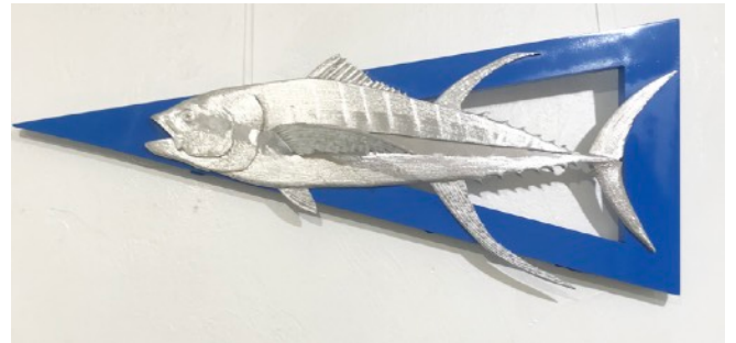
HONORABLE MENTION Blue Luis Lache Lugo _ Aluminum Sculpture

Many thanks to all of the artists who entered this show which featured 30 pieces of art in many different styles and seven different mediums.