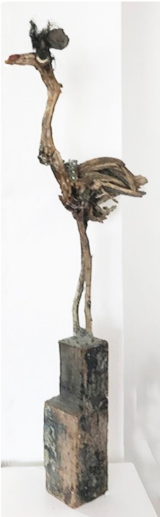
SECOND PLACE Coo Coo the Roadrunner Sima Benjet _ Desert Driftwood Assemblage