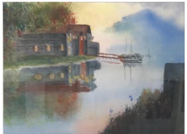
RECOGNITION Misty Cove Corbin Lutz _ Watercolor