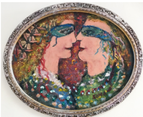
HONORABLE MENTION Mardi Gras Lovers Sima Benjet_ Acrylic