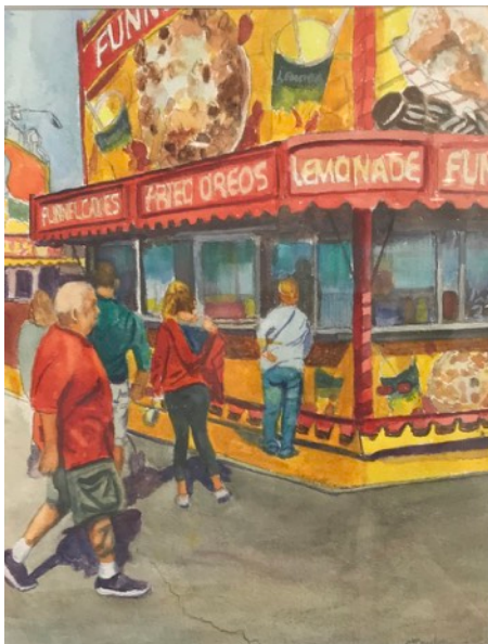
SECOND PLACE Florida Fair George Taylor _ Watercolor

© All art images are copyrighted by the individual artist.