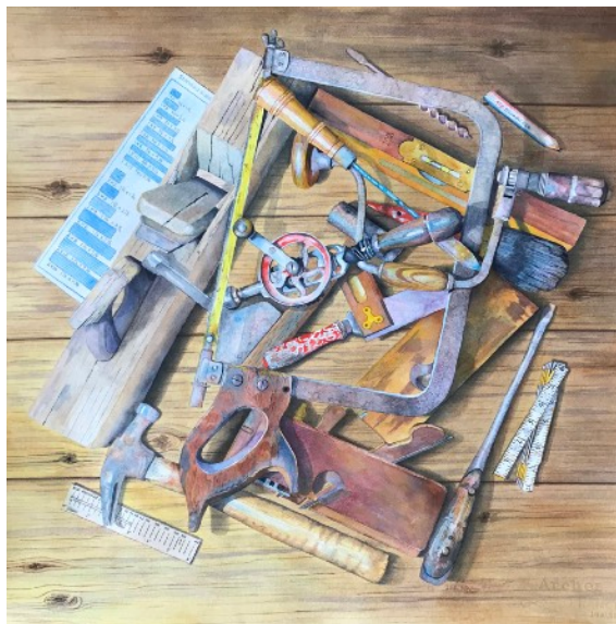
THIRD PLACE The Family Tools Lee Krull _ Watercolor