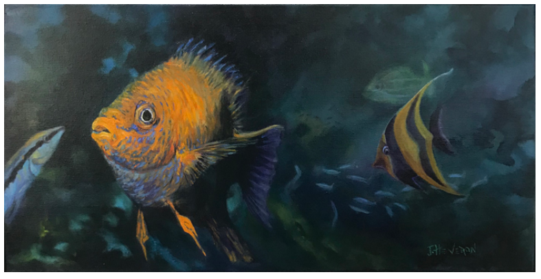
THIRD PLACE Golden Damselfish Jill Heveron_Oil

36 pieces of art were judged in this show that was open to all artists. Artworks were created in the following mediums: Photography, Oil, Acrylic, Watercolor, Colored Pencil, Clay, Cold Wax, and Collage.