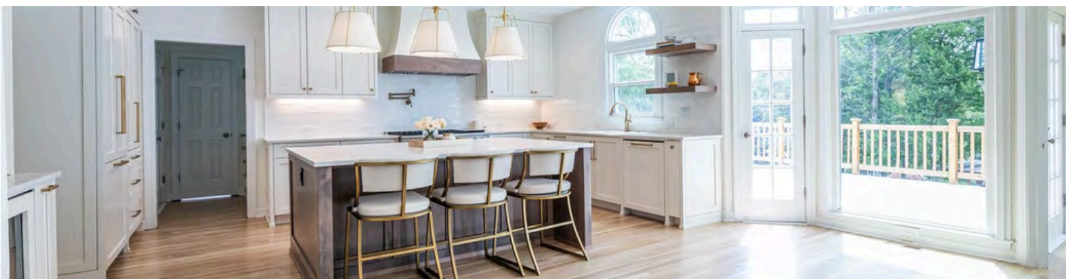
Danielle Stanley Kitchen Renovation Featuring A Touch of Stone Fabrication

Funky! I'm finding clients are feeling more risky and pulling away from the classic, white kitchen designs. The more organic, natural textures are in the forefront of the current trends and allow for so many more options when it comes to movement in stone.