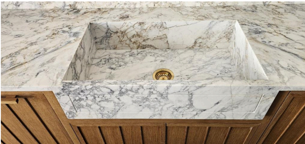
Integrated Farm Sink

This is a classic approach to fabricating a kitchen sink.