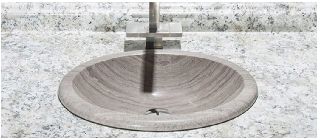
Drop In Stone Sink

*Tip Make sure you seal the stone on a regular basis