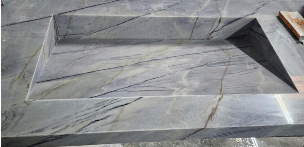
Slanted Integrated Sink

This is a modern approach to fabricating sinks.