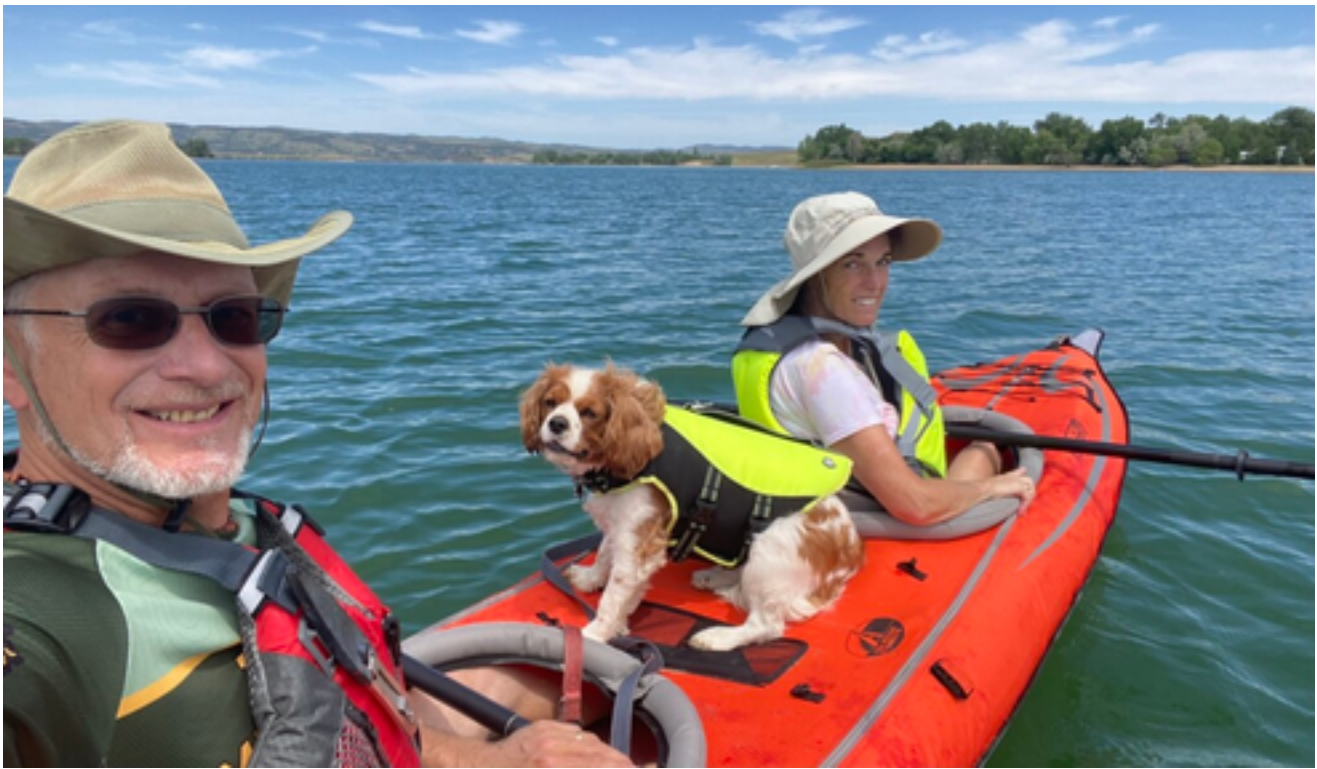
Hershey Pup kayaking on RV campground lake