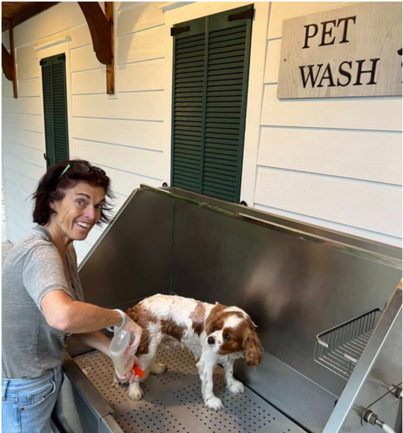
Pet wash station at RV park