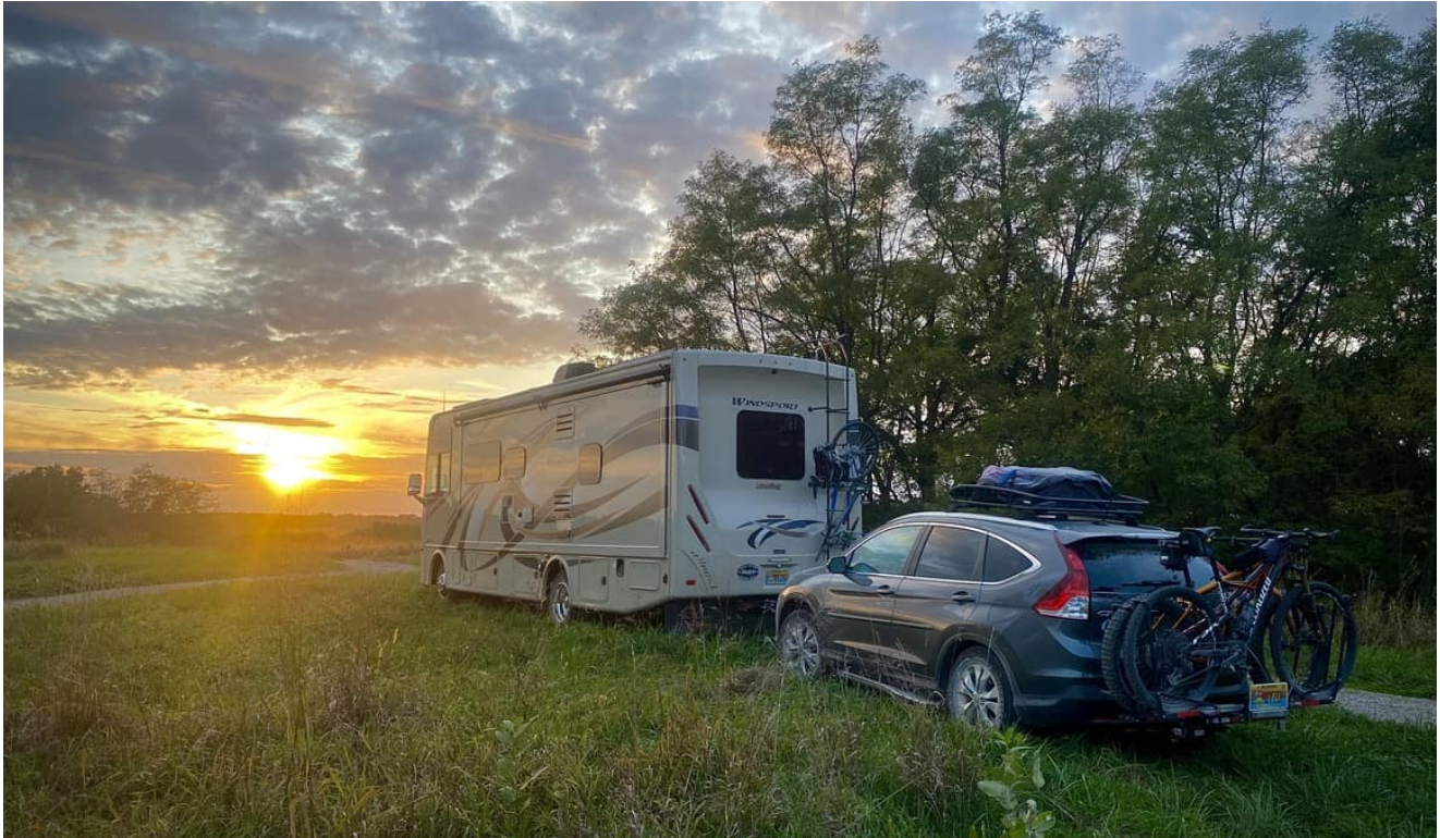
Reserving the best RV campsites pays off.