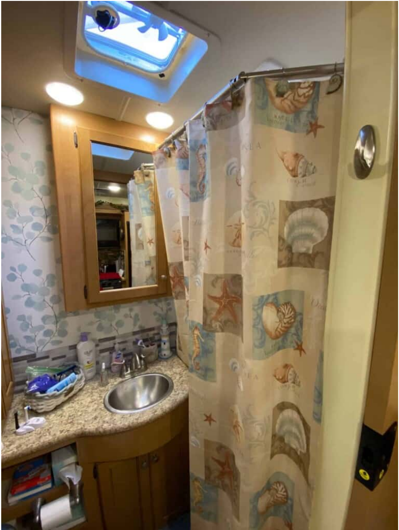
RV shower upgrade with extended curtain rod