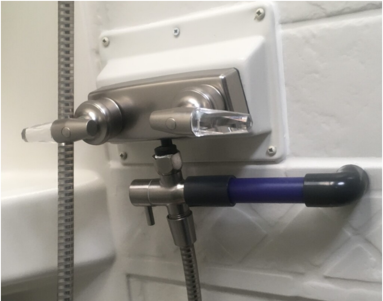
Shower Miser Kit

Once hot water reaches the ShowerMiser device, the blue temperature-reactive plastic tube turns white. Then, we flip the diverter valve and take a nice, hot shower.