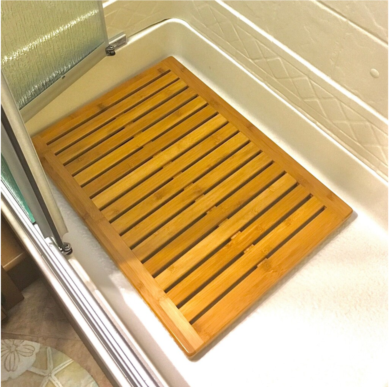
Bamboo shower mat

We've had it for nearly four years and it's still in great shape.