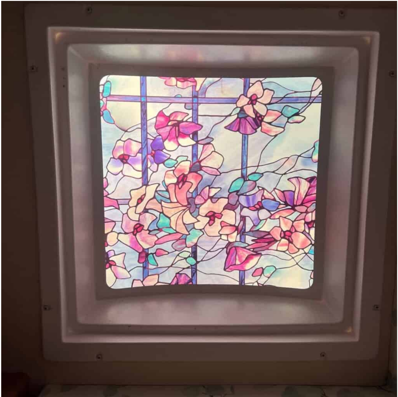
Artscape RV shower upgrade window cling decal

For our skylight RV shower upgrade, we purchased the Artscapes brand of decorative cling-film at Home Depot. This company makes their products in the USA and they also have an Amazon Artscape Store .