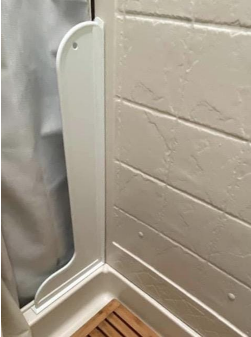
RV shower upgrade splash guard