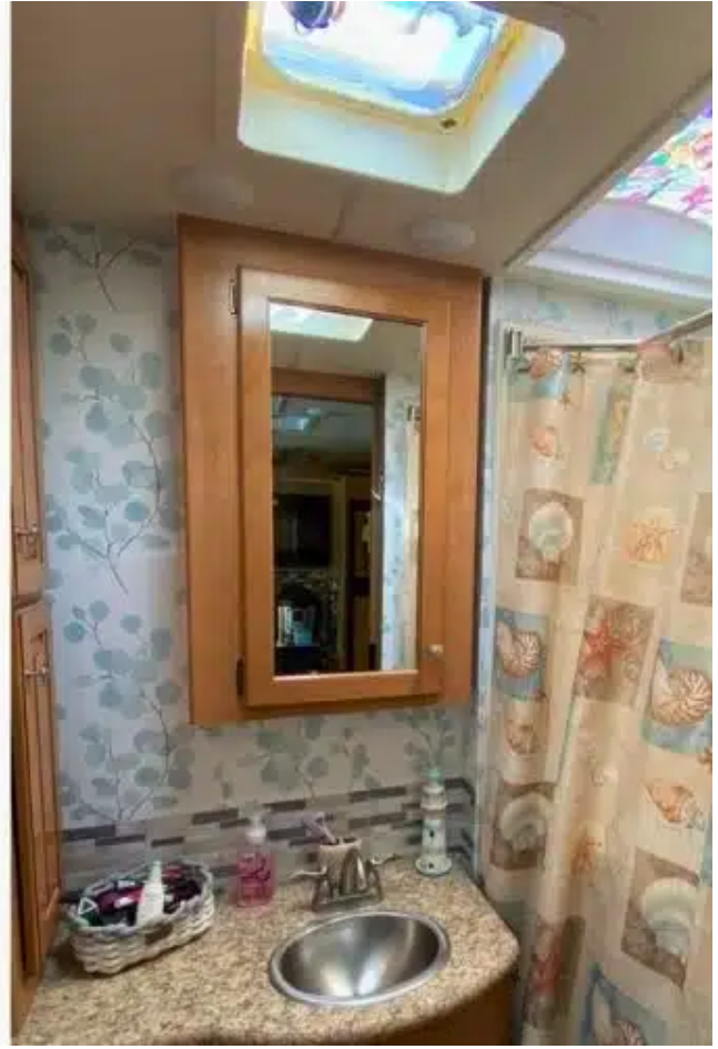
Before and after photos (side by side wallpaper improvement)

Once it was done, however, it really brightened up the bathroom and we've been very happy with the new look. I was initially worried about how long the self-adhesive product would last in an RV. But, after two years, 32,000 miles, and cold to hot, humid environments, it still looks as good as the day I installed it.