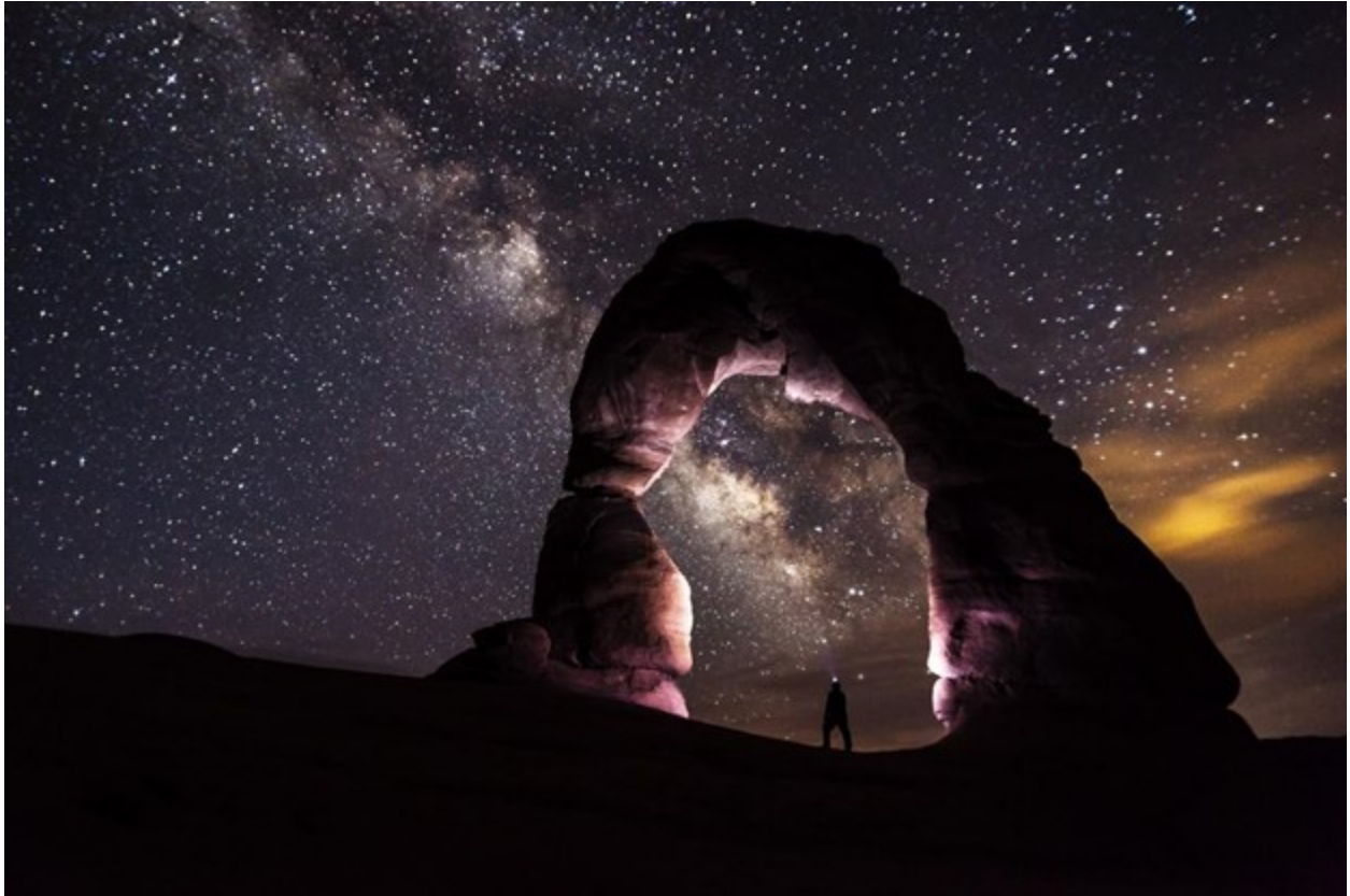
Delicate Arch, Arches National Park, Utah (CC0 non-copyrighted free domain image)