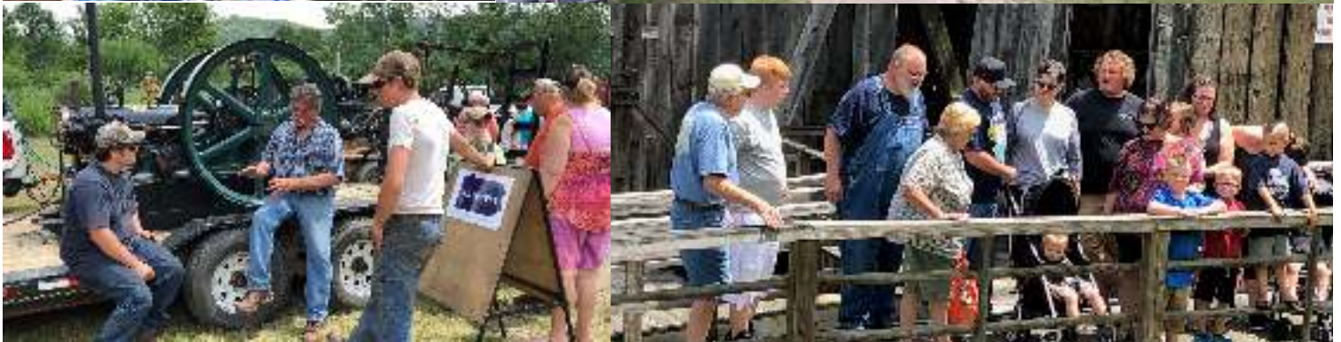
Derrick Day Festival 2018 was filled with many engine and equipment displays as well as food, games, crafts and lots of fun for everyone.