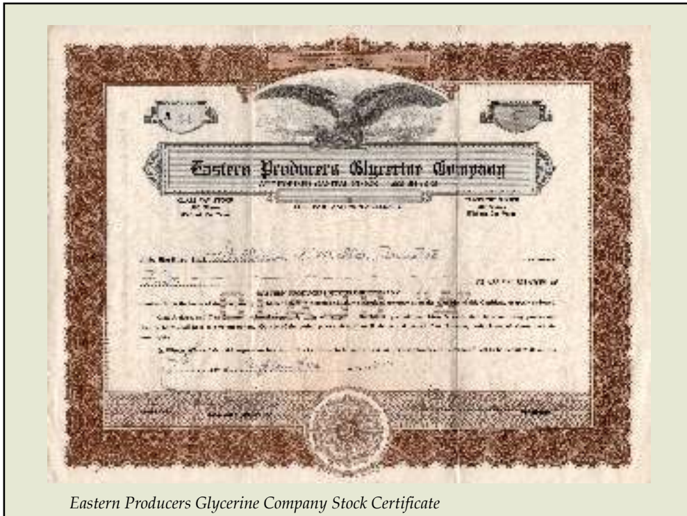
Eastern Producers Glycerine Company Stock Certificate