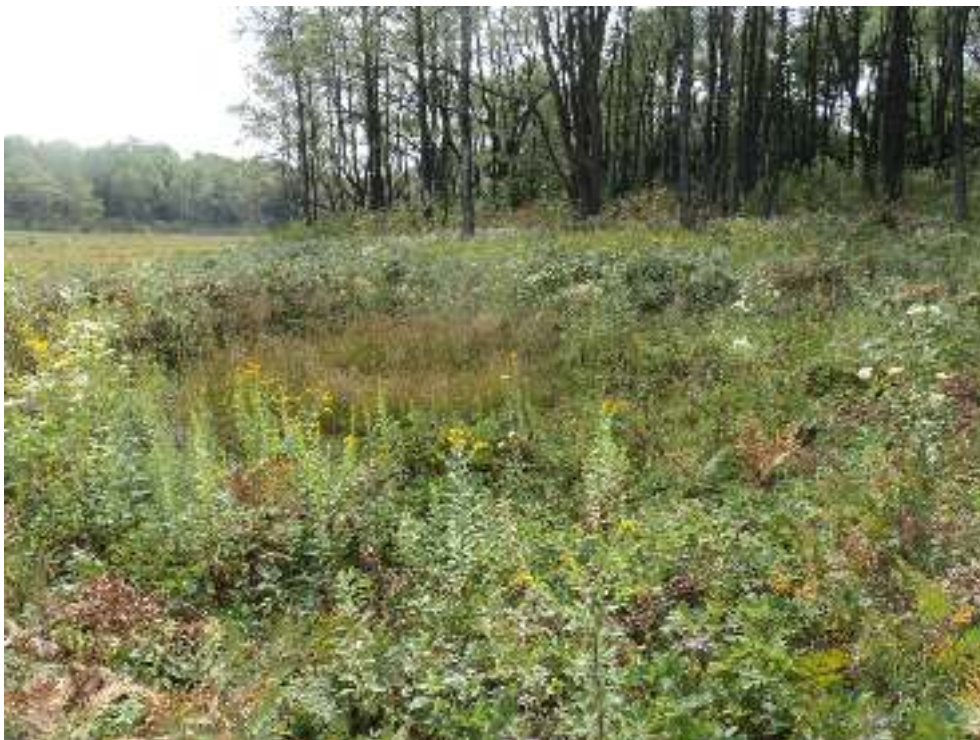
Hole from McQueeney Nitro Glycerine Explosion